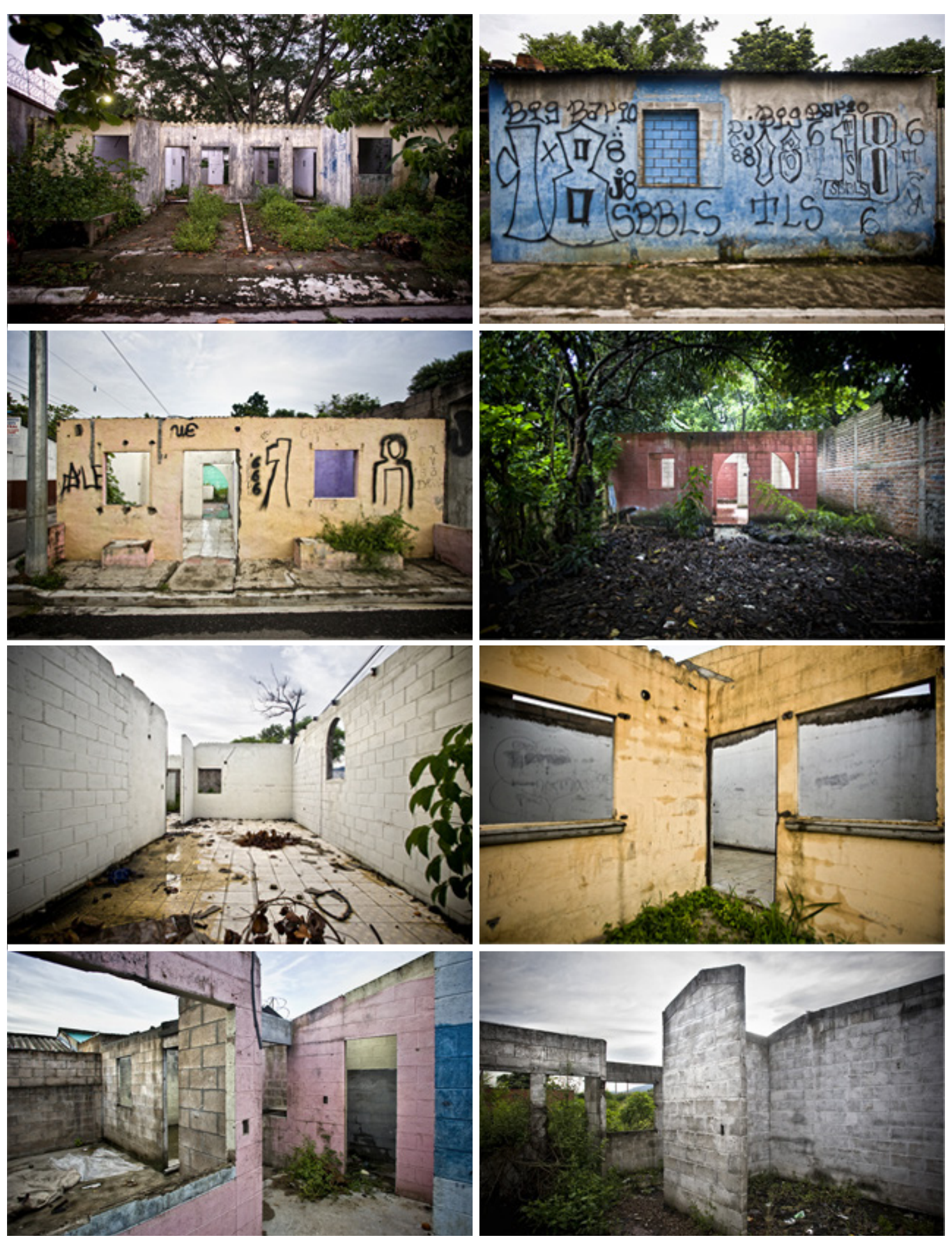
Homes abandoned by families fleeing gang violence.